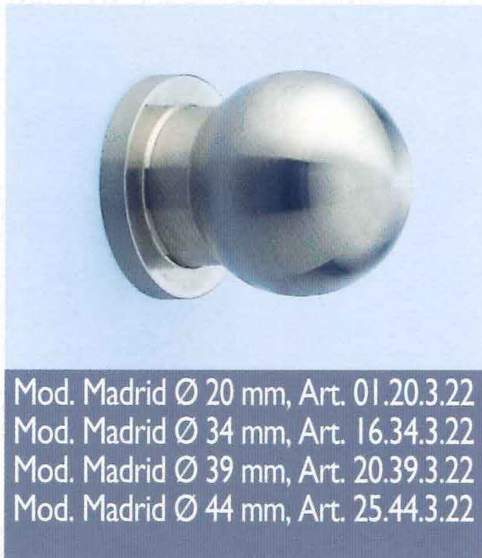
Mod. Madrid Ø 20 mm, Art. 01.20.3.22 Mod. Madrid Ø 34 mm, Art. 16.34.3.22 Mod. Madrid Ø 39 mm, Art. 20.39.3.22 Mod. Madrid Ø 44 mm, Art. 25.44.3.22