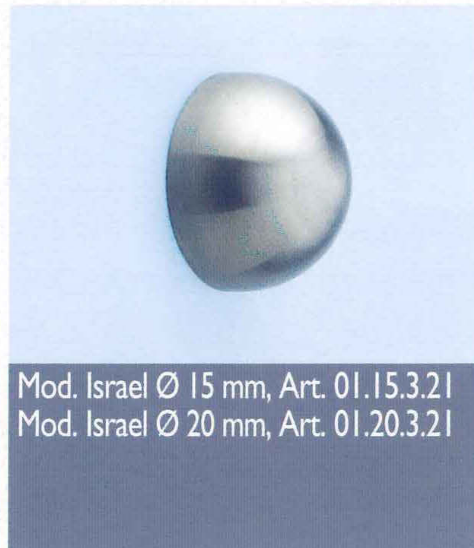
Mod. Israel Ø 15 mm, Art. 01.15.3.21 Mod. Israel Ø 20 mm, Art. 01.20.3.21