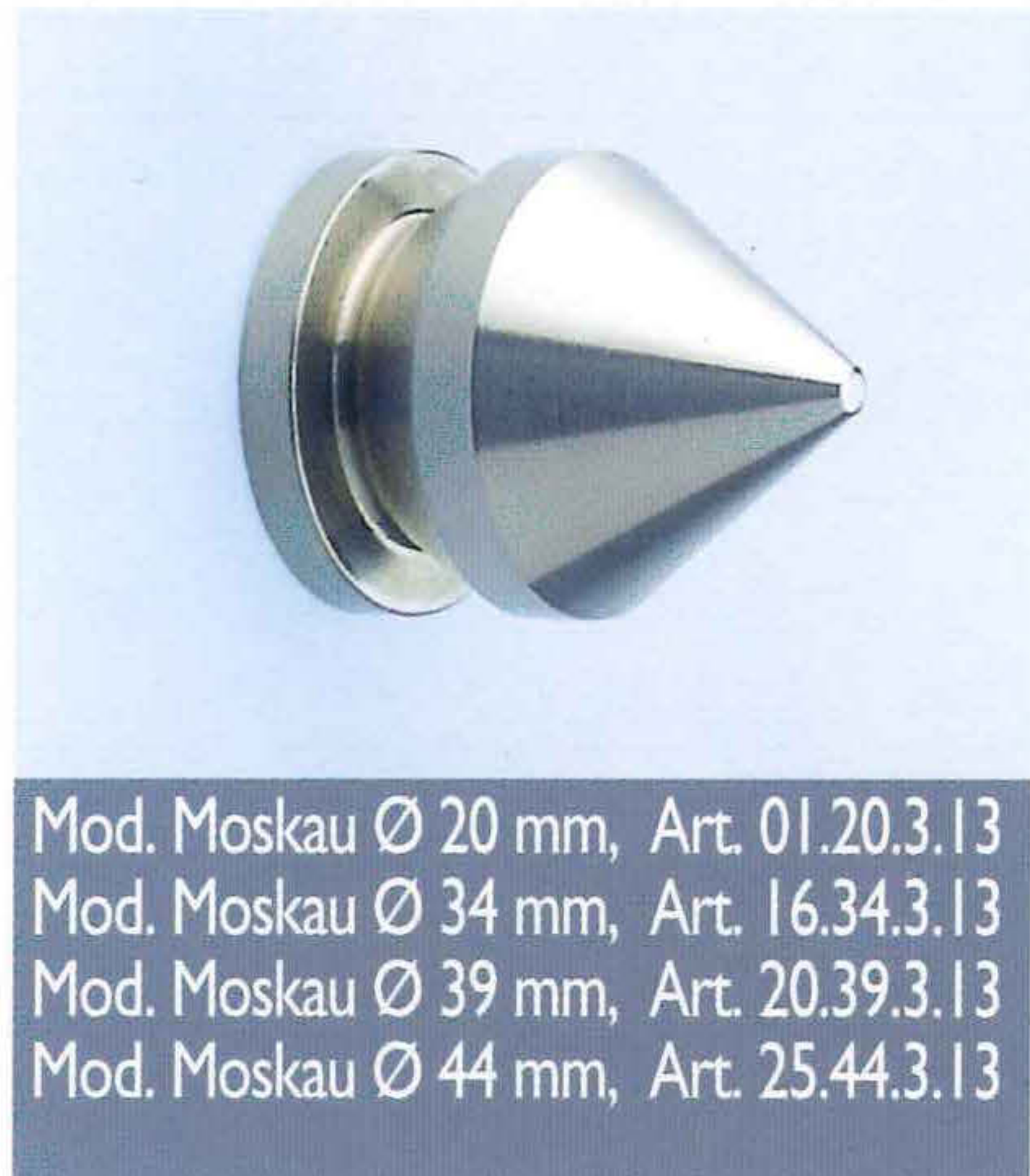
Mod. Moskau Ø 20 mm, Art. 01.20.3.13 Mod. Moskau Ø 34 mm, Art. 16.34.3.13 Mod. Moskau Ø 39 mm, Art. 20.39.3.13 Mod. Moskau Ø 44 mm, Art. 25.44.3.13