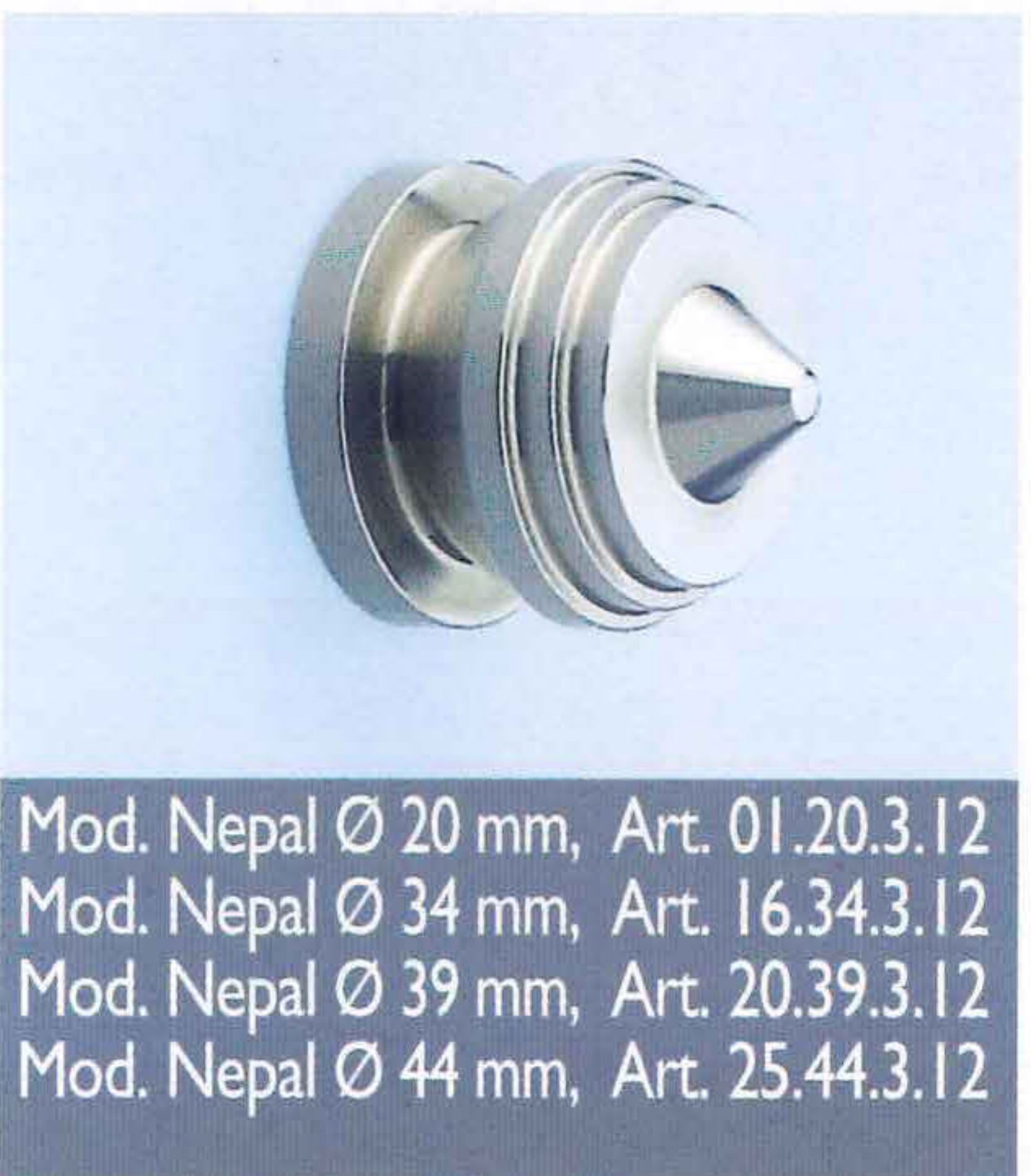
Mod. Nepal Ø 20 mm, Art. 01.20.3.12 Mod. Nepal Ø 34 mm, Art. 16.34.3.12 Mod. Nepal Ø 39 mm, Art. 20.39.3.12 Mod. Nepal Ø 44 mm, Art. 25.44.3.12