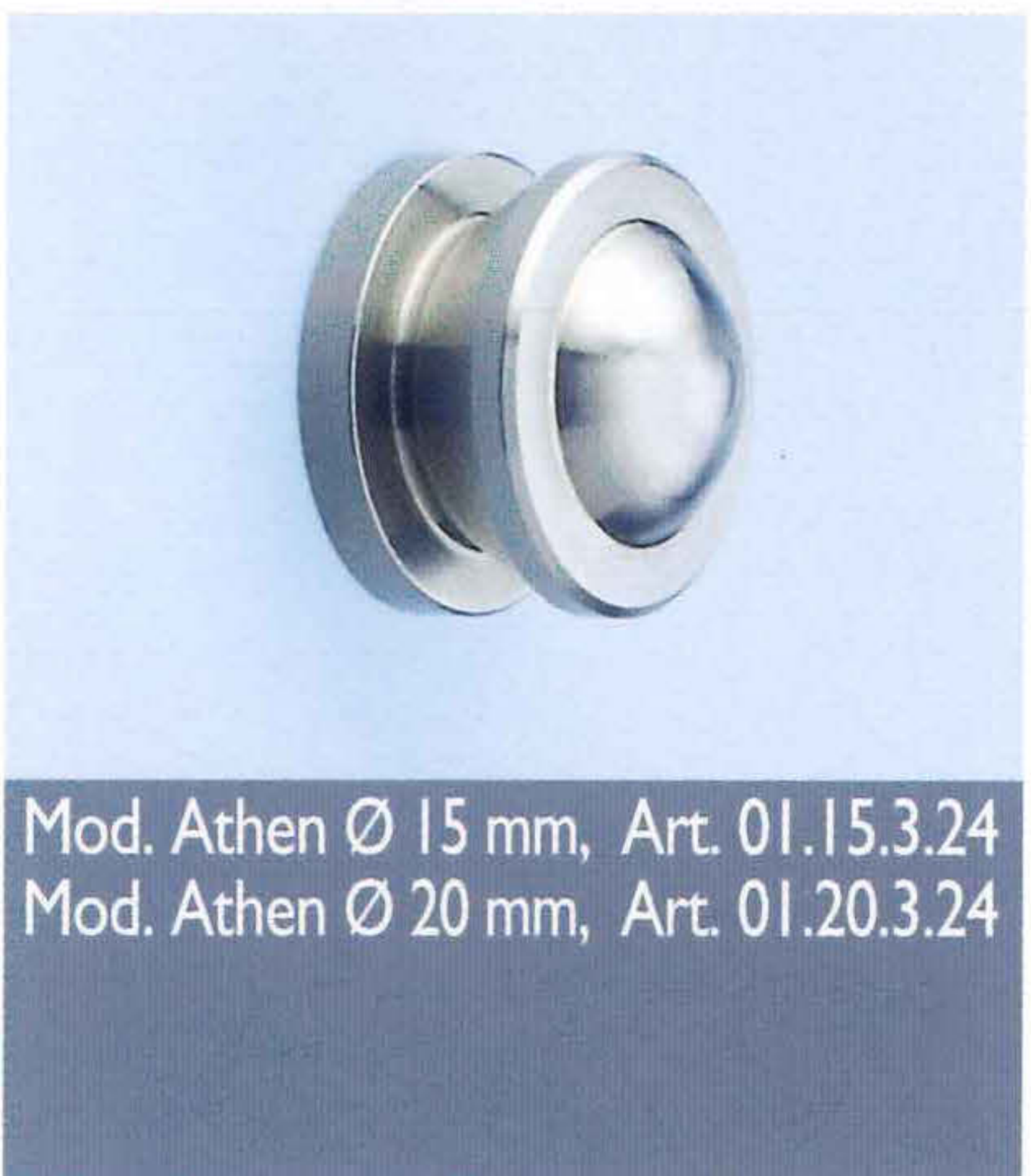
Mod. Athen Ø 15 mm, Art. 01.15.3.24 Mod. Athen Ø 20 mm, Art. 01.20.3.24