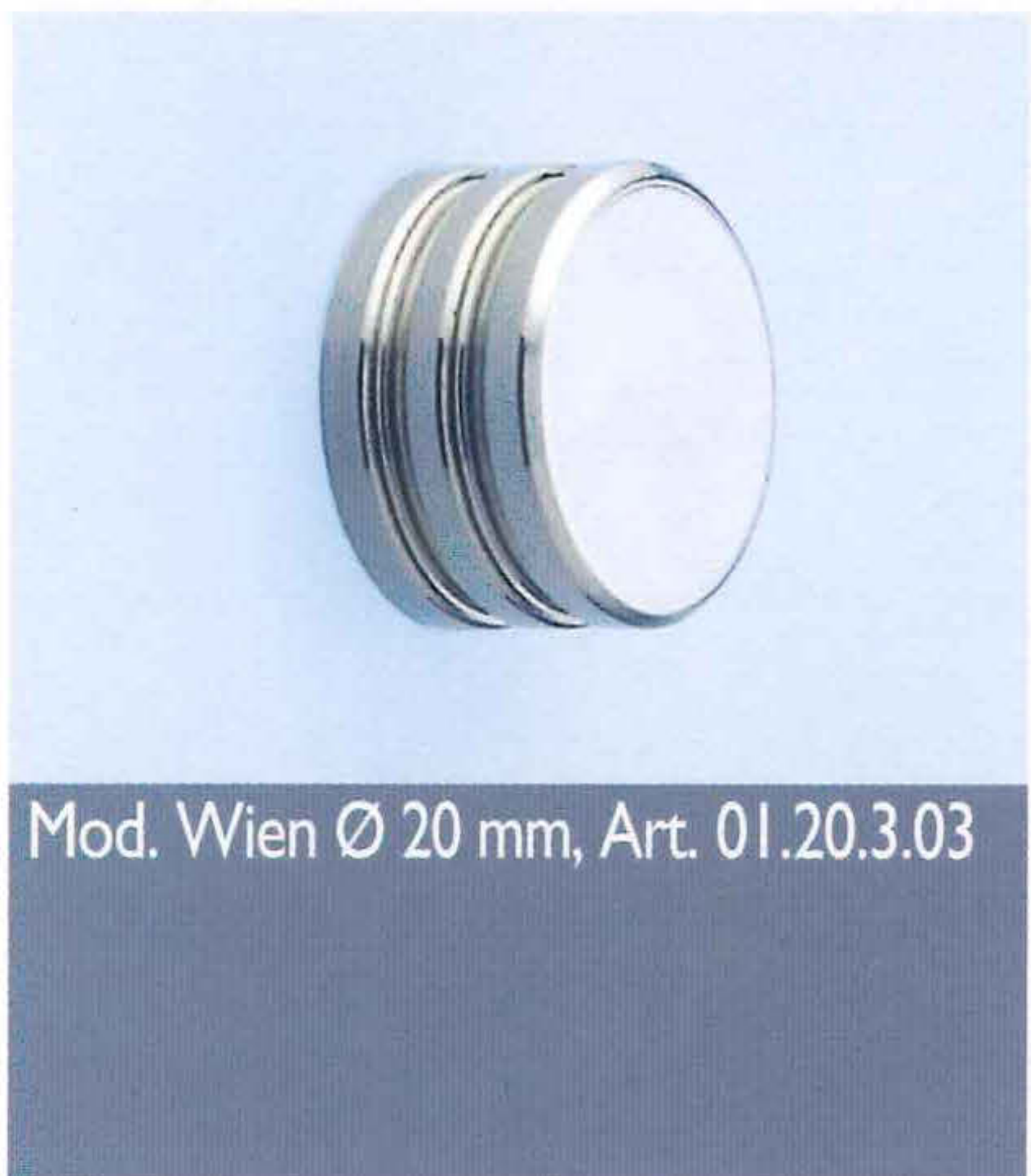
Mod. Wien Ø 20 mm, Art. 01.20.3.03