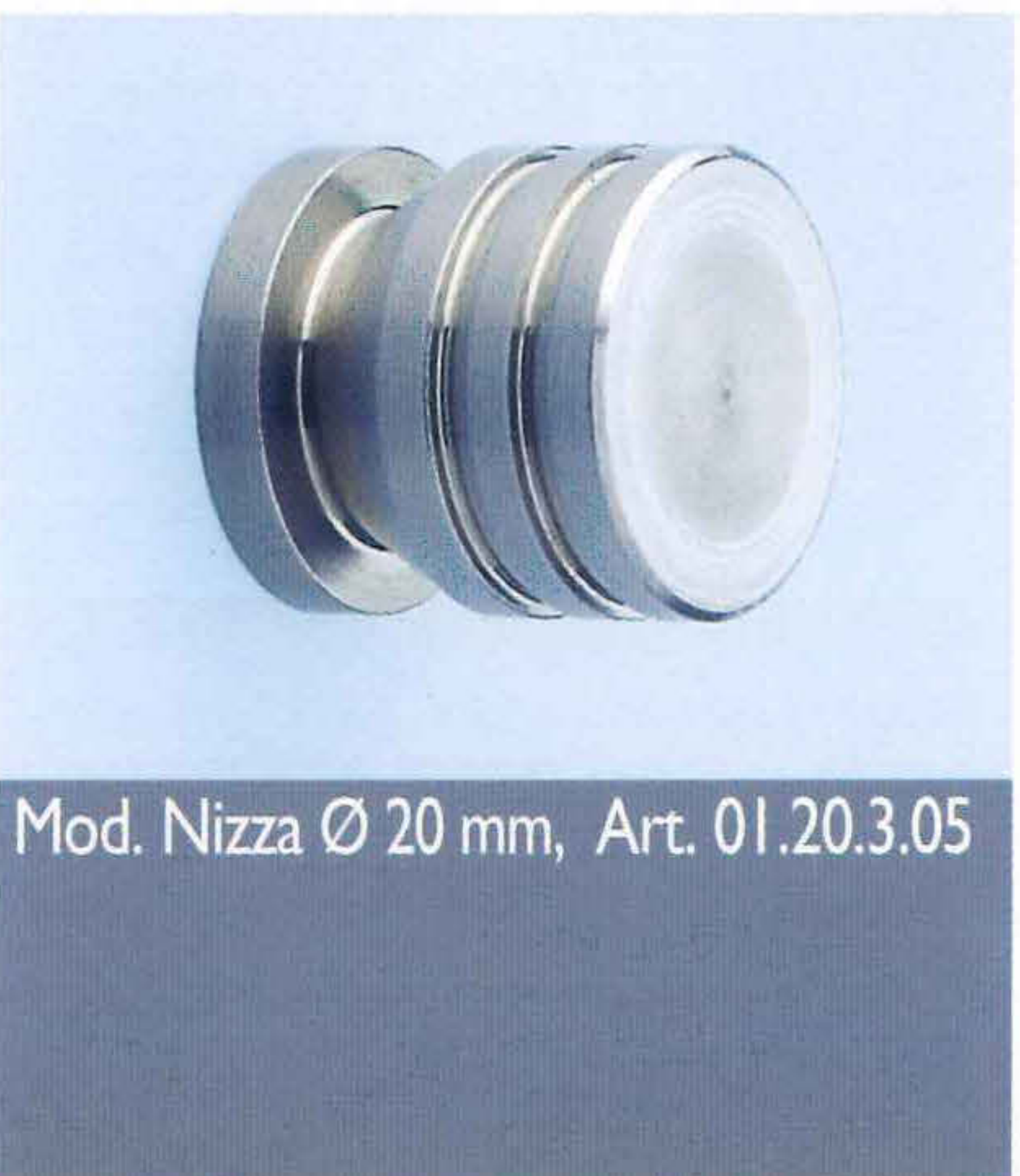
Mod. Nizza Ø 20 mm, Art. 01.20.3.05