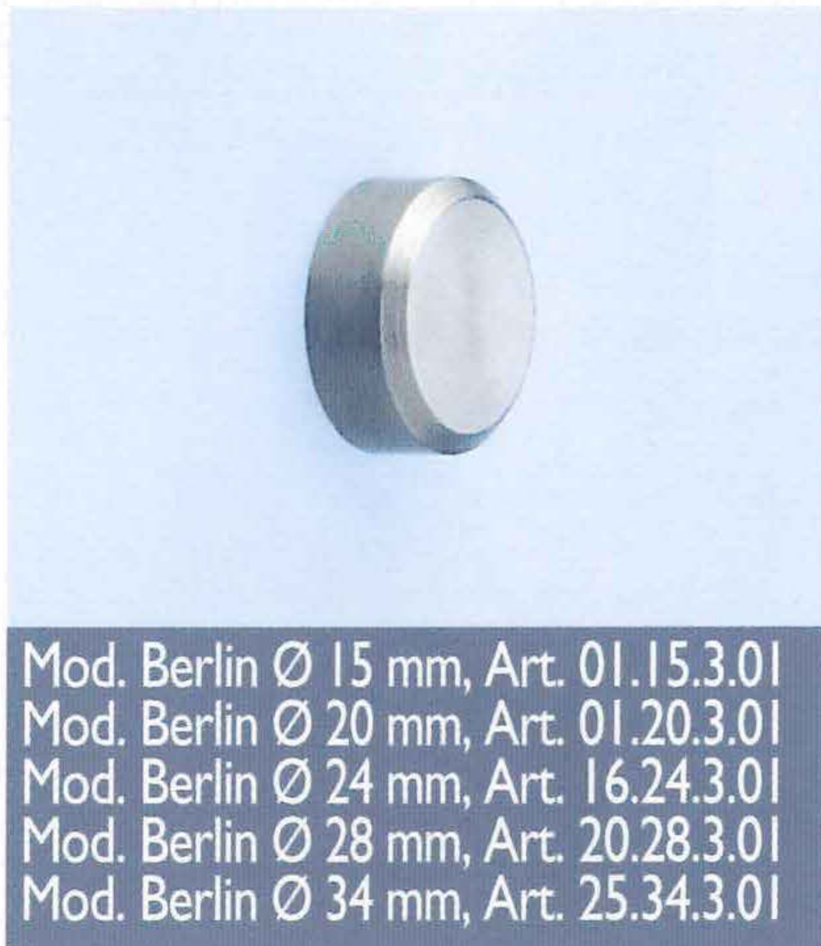
Mod. Berlin Ø 15 mm, Art. 01.15.3.01 Mod. Berlin Ø 20 mm, Art. 01.20.3.01 Mod. Berlin Ø 24 mm, Art. 16.24.3.01 Mod. Berlin Ø 28 mm, Art. 20.28.3.01 Mod. Berlin Ø 34 mm, Art. 25.34.3.01