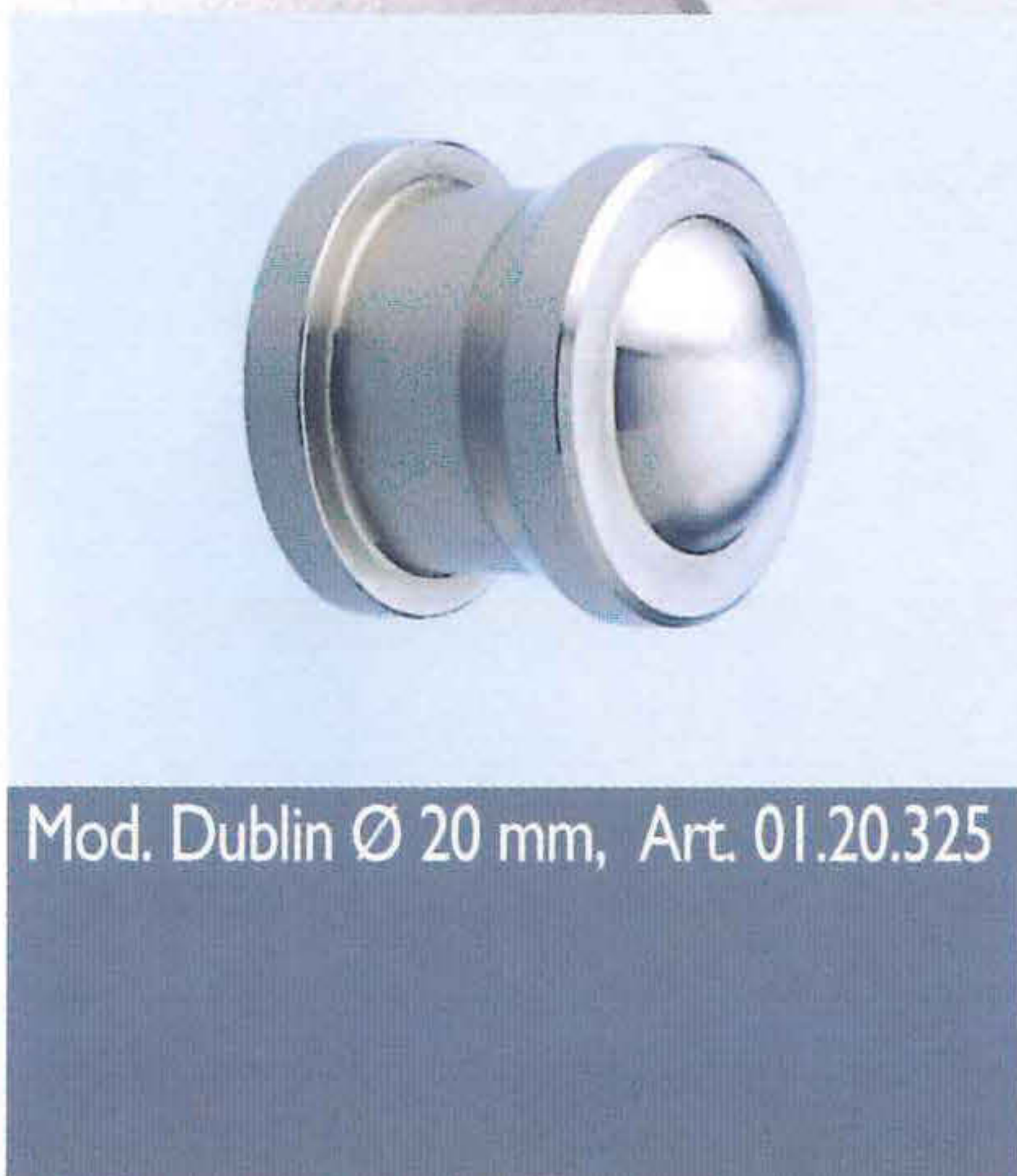
Mod. Dublin Ø 20 mm, Art. 01.20.3.25