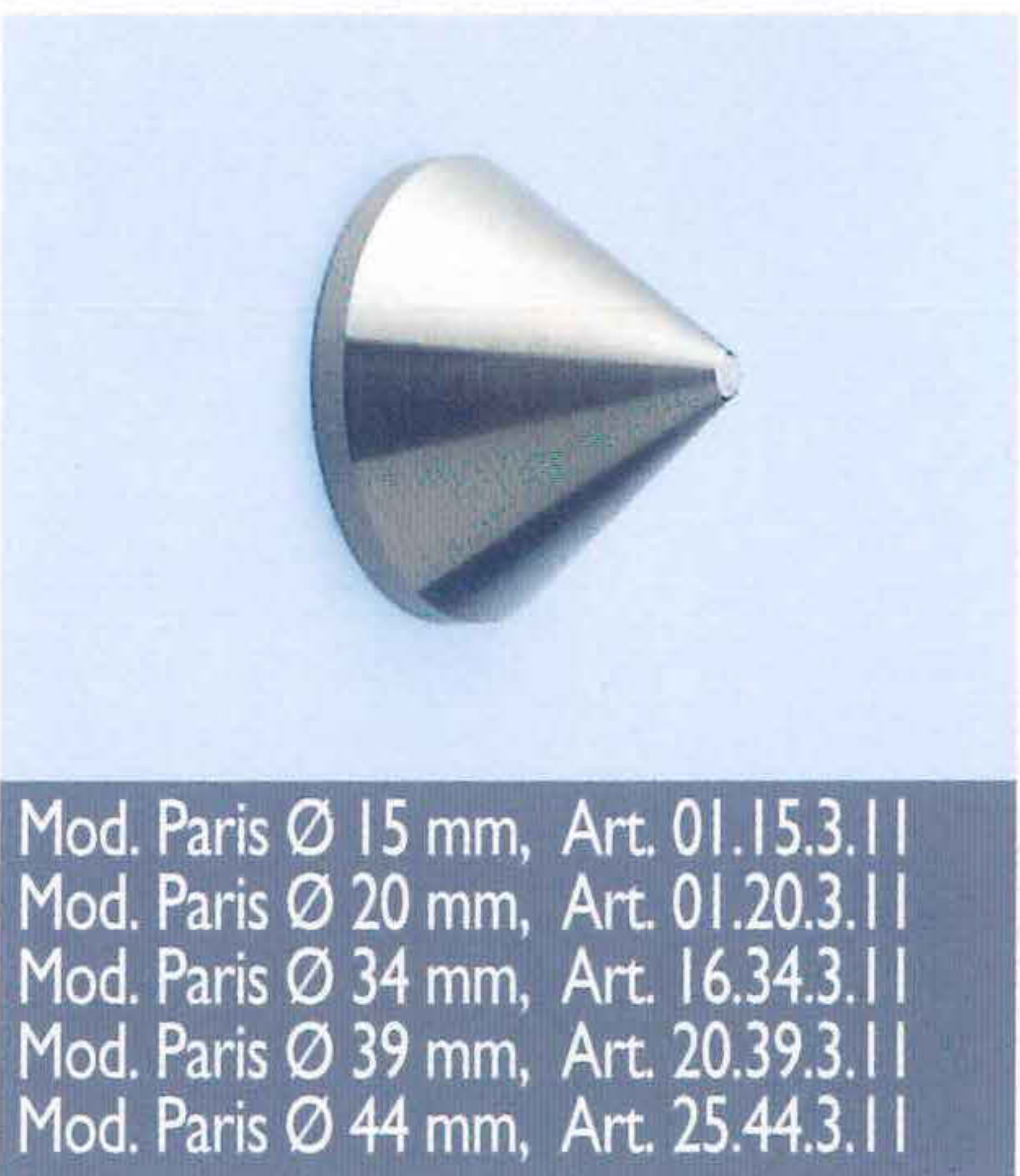
Mod. Paris Ø 15 mm, Art. 01.15.3.11 Mod. Paris Ø 20 mm, Art. 01.20.3.11 Mod. Paris Ø 34 mm, Art. 16.34.3.11 Mod. Paris Ø 39 mm, Art. 20.39.3.11 Mod. Paris Ø 44 mm, Art. 25.44.3.11