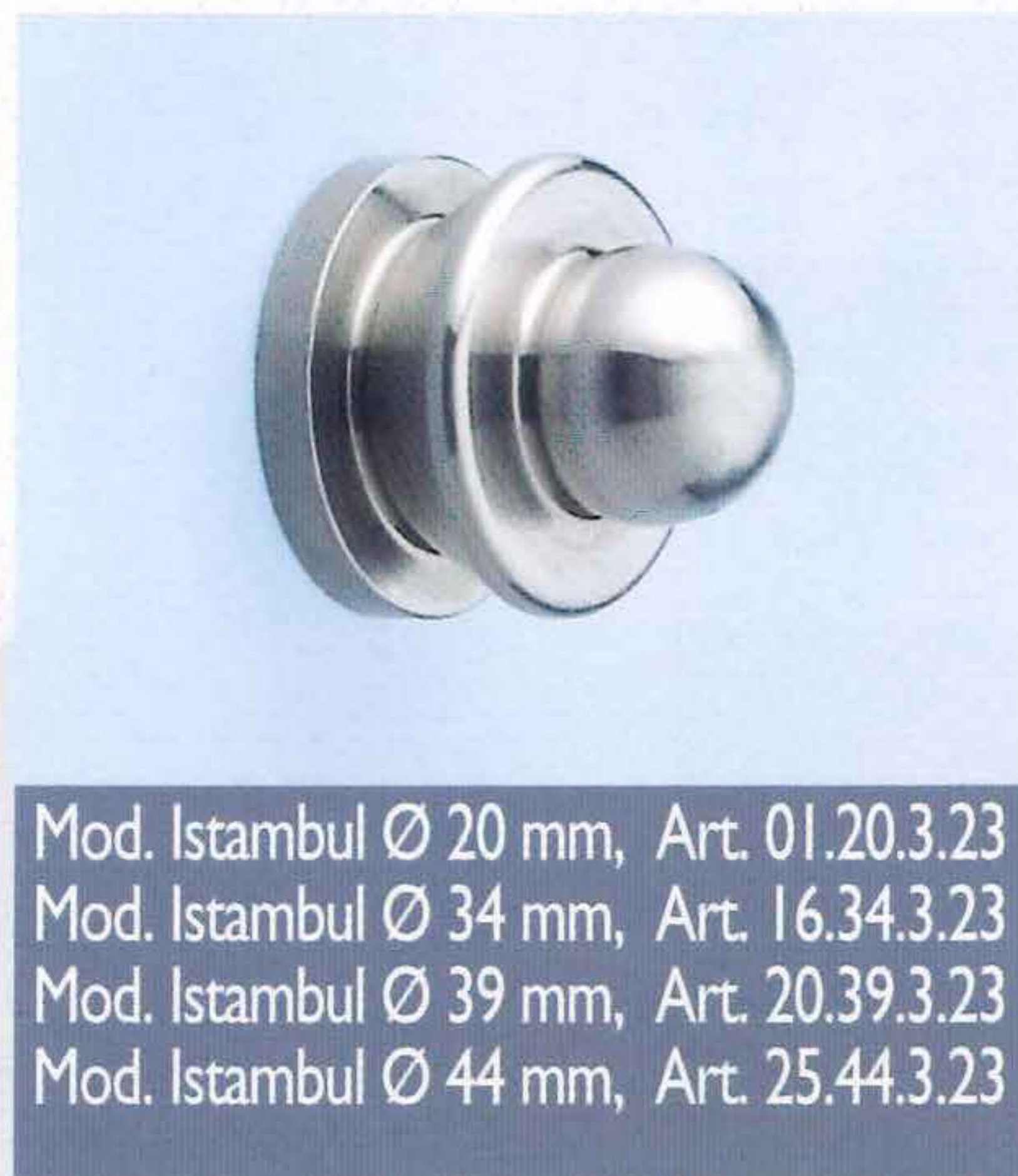
Mod. Istanbul Ø 20 mm, Art. 01.20.3.23 Mod. Istanbul Ø 34 mm, Art. 16.34.3.23 Mod. Istanbul Ø 39 mm, Art. 20.39.3.23 Mod. Istanbul Ø 44 mm, Art. 25.44.3.23