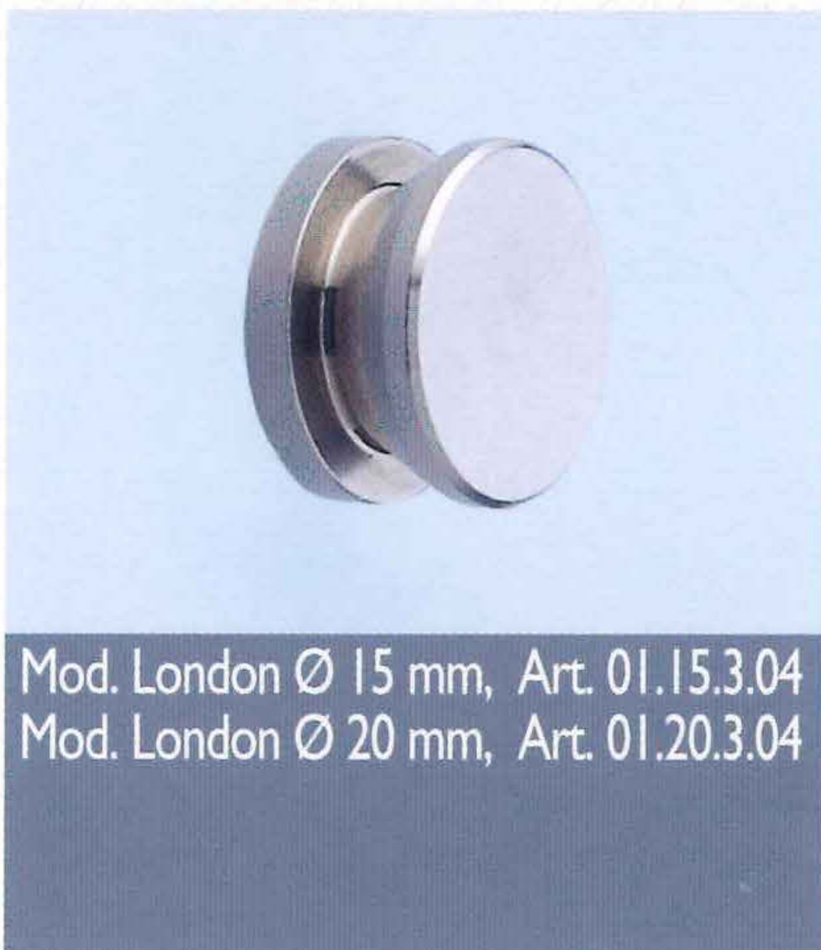
Mod. London Ø 15 mm, Art. 01.15.3.04 Mod. London Ø 20 mm, Art. 01.20.3.04